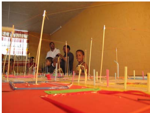
An exercise in perspective (select images)