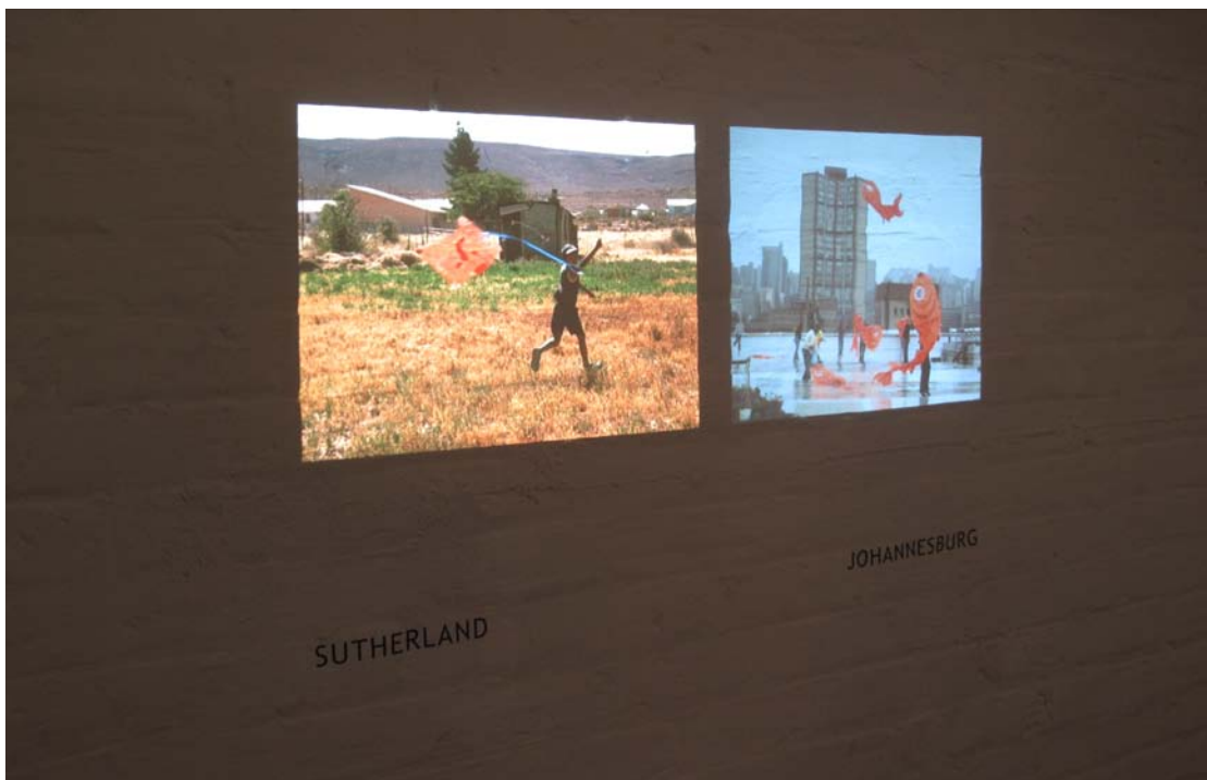
Sutherland - Johannesburg Slide show projection Dimensions Variable 2009